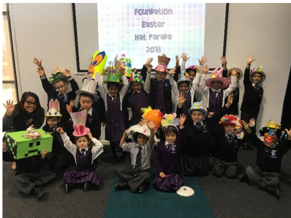
Keeping up with Easter fashion at SCG is a 'tall order' sometimes...