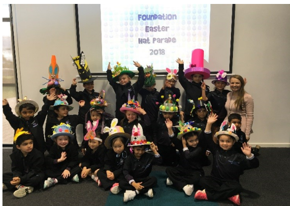
Students of FBU & FRM showing off their crafty Easter hats

There was much care and thought put in to designs and colour over the term break – and we hope family members had fun helping out!