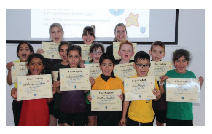
Reminder: School Hats for Term 4

We look forward to your contributions both in your class in with the broader Junior School activities and events we host.