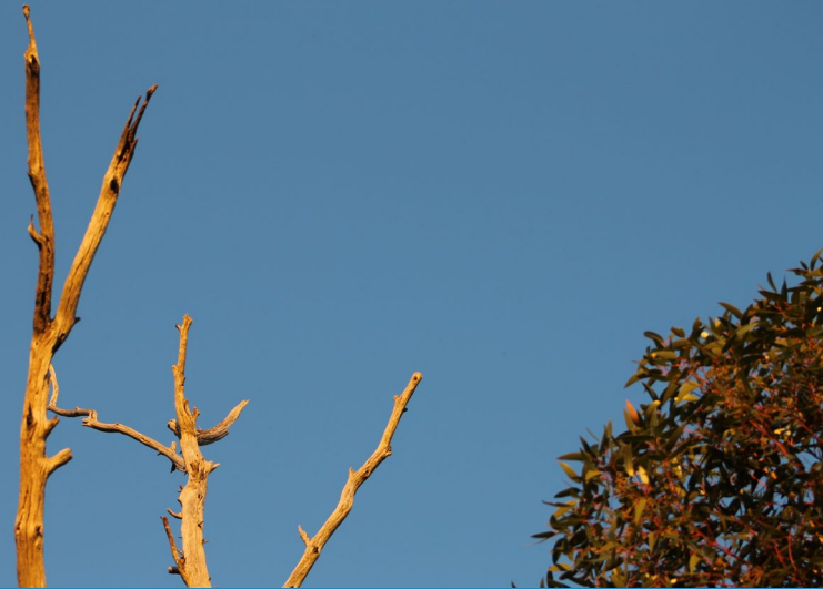
Victoria Skrekovski: My photograph shows how the same species of tree can display both large branches, and soft green leaves. Even though the tree may not be living, it is still standing strong due to deep roots and a thick stem.