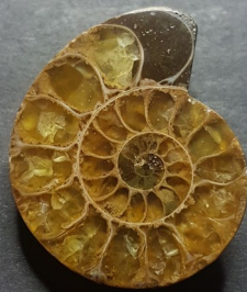
Callum Weir: My photographs show the Fibonacci Sequence as seen in a Pine Cone and in an Ammonite Shell.