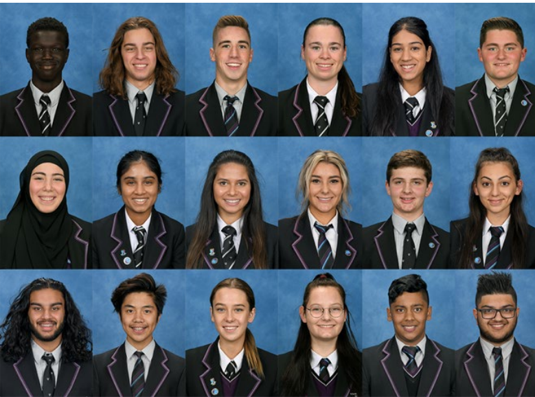
SCG's first cohort of Year 12 Students