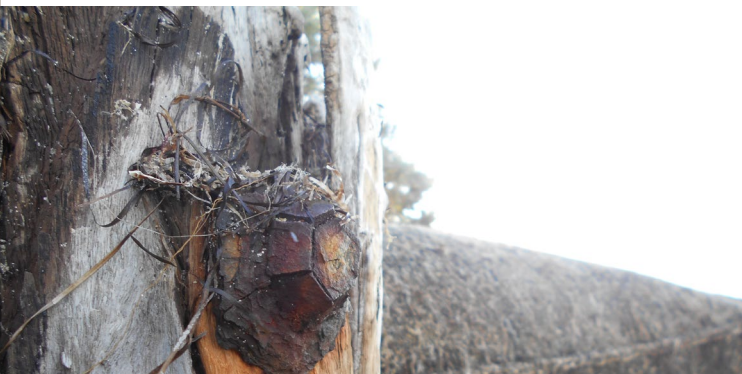
Bethany Ferraro: This picture illustrates the change in the shape of a metal bolt. This is due to corrosion.