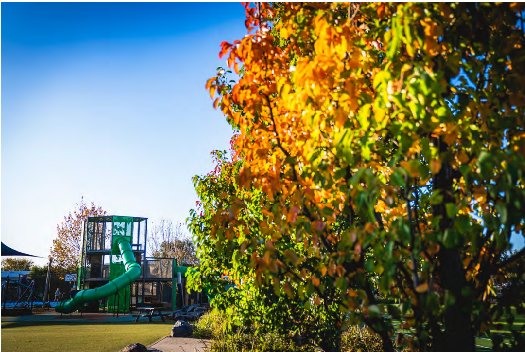
Pictured: New playground

We enhanced classroom functionality across the Primary School by installing new cabinetry in each room. These upgrades provide improved storage solutions, ensuring that learning materials, resources, and student belongings are organised and easily accessible. The new cabinetry not only supports a tidy and efficient learning environment but also allows for greater flexibility in classroom setup and organisation.